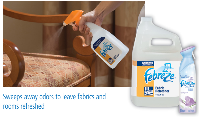
Sweeps away odors to leave fabrics and rooms refreshed

Please Note: Offer good only in the 50 United States of America, and the District of Columbia & Puerto Rico. Offer expires 03/31/12. Maximum refund $2000. Allow 8-10 weeks for delivery of your Rebate Check. Maximum one location per rebate request. Limit one check mailed per address. Requests from P.O. Boxes (other than ND), groups, clubs or organizations will not be honored or returned. Sale, trade, or purchase of CERTIFICATE is prohibited. Alteration or attempted alteration, transfer, sale or purchase of distributor invoices or velocity reports is prohibited and constitutes fraud. Fraudulent submissions will not be honored and may be prosecuted (18 USC §§1341, 1342). Please make a copy of your rebate submission for your files. Sponsor is not responsible for non-complying Rebate Submissions or for late, lost, illegible, postage due or undeliverable mail. Non-complying Rebate Submissions will not be honored, and may not be acknowledged or returned. Limit: One Rebate Request per location, as allowed by law. Not valid in combination with any other offer. Cash Value: 1/100¢. Void where taxed, restricted or prohibited. OFFER EXPRESSLY EXCLUDES: Payments on partial cases, Purchases made by non-business users and direct buying customers, Purchases bought under P&G's contract programs and Payments to third party agents.